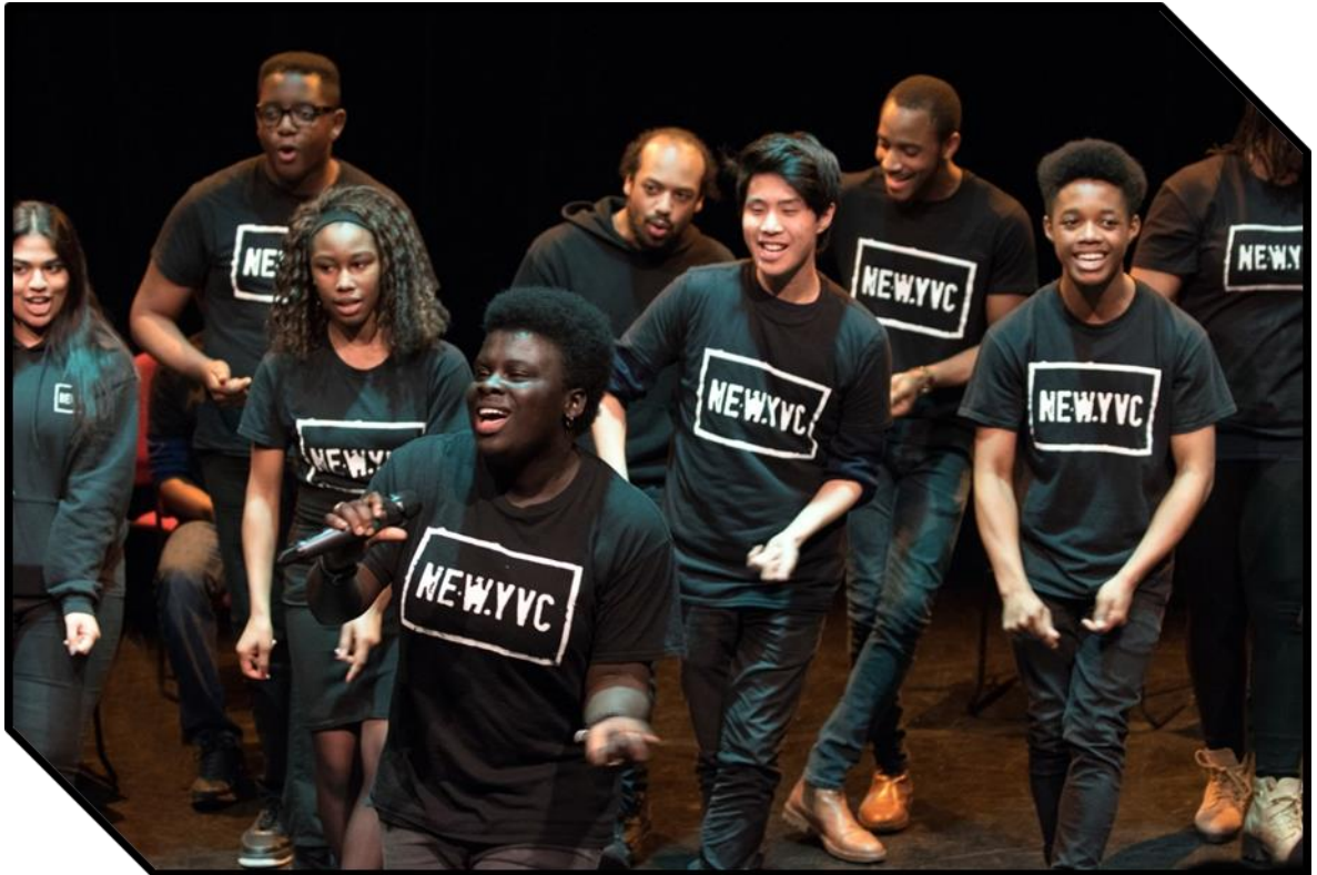
Photo: Performance by Stratford Circus's New Young Voice Collective. Young musicians are trained as music mentors to deliver workshops in schools across Stratford using diverse repertoire, culminating in high profile performances at the Southbank Centre.