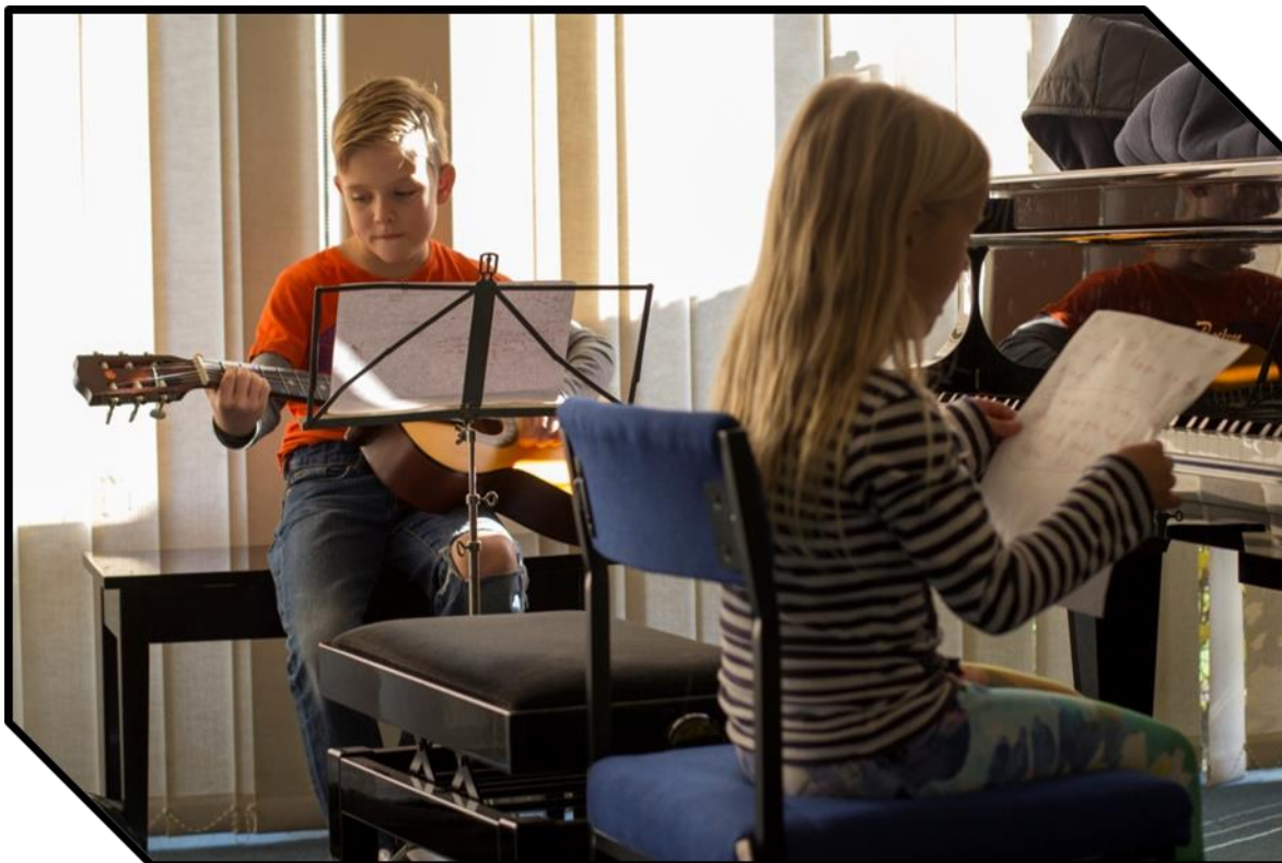
Photo: young musicians practicing an original composition as part of MusicNet East's Songwriter project, which supports young people's creative songwriting skills.